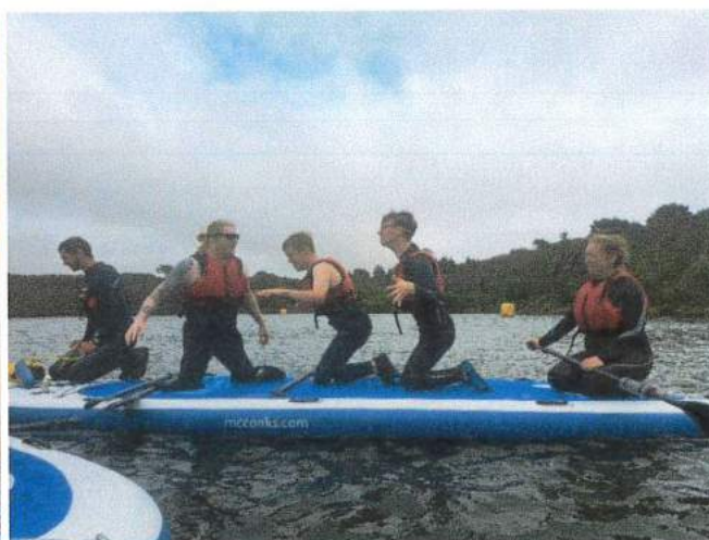
Image above, left shows: Illumin8 mentors at the mentoring training session.

Image above, right shows: Acceler8 members and their Illumin8 mentors teambuilding while paddleboarding.