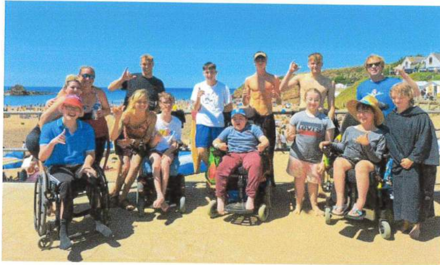
Image above: the 2021-2023 Acceler8 group at the beach.