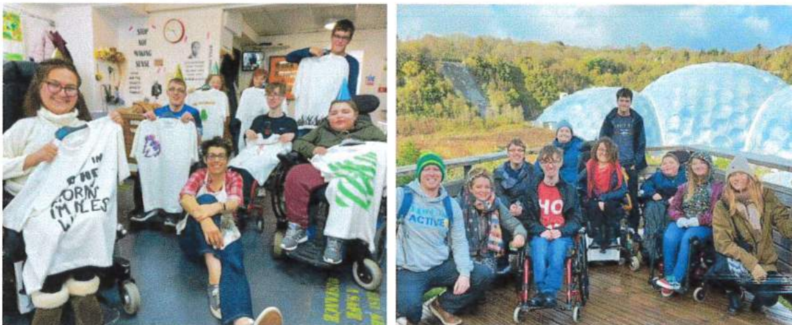
Image above, left: Acceler8 members holding up t-shirts they designed and screen printed.

Active8 have also arranged for members to take part in a local University Open Day so that they can begin exploring some of their post-16 choices.